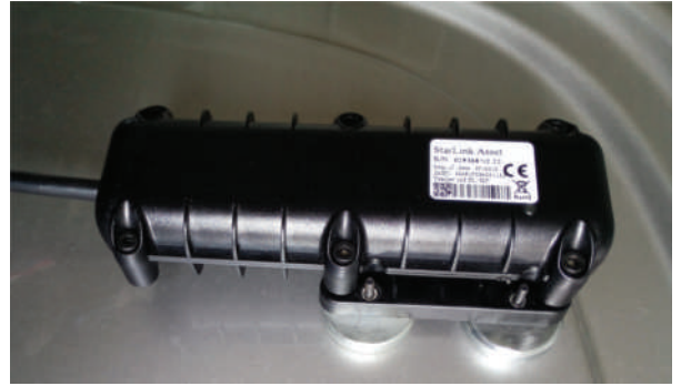
Powerful magnet kit